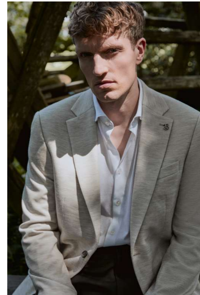
Single Blazer Jersey 7834-5038-90 UVP 99,95 €