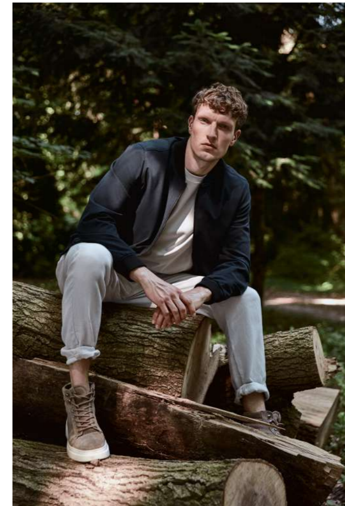
Blouson 6089-2835-680 UVP 159,95 €