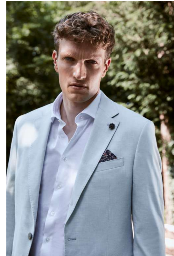
Wedding Suit Linen Blend Pastell