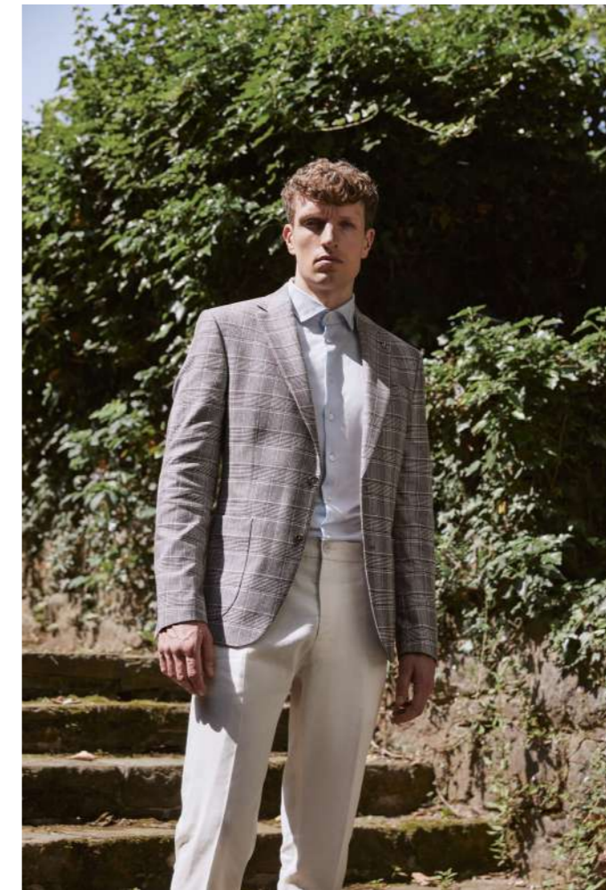
Single Blazer Linen Blend 7834-4611-460 UVP 149,95 €